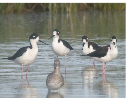
Black-necked Stilts

On 8/20 an American Wigeon was found on Mill Pond in Marstons Mills