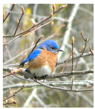
Eastern Bluebird